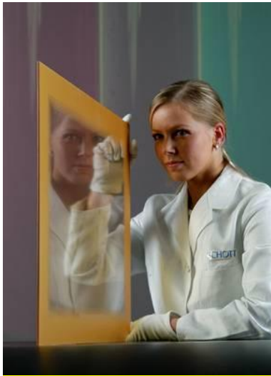
Photo no. 22994: Lead-free decorative colors for “Robax”: By expanding its color range, SCHOTT now offers its “Robax” glass-ceramic in more colors for stoves and fireplaces.