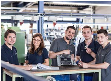
Apprentices in the Training Workshop