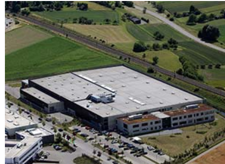
Injection moulding plant in Rottenburg-Ergenzingen