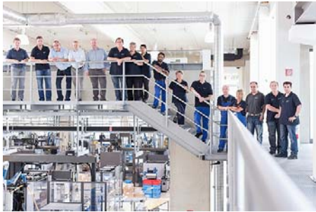
Employees in the injection moulding shop