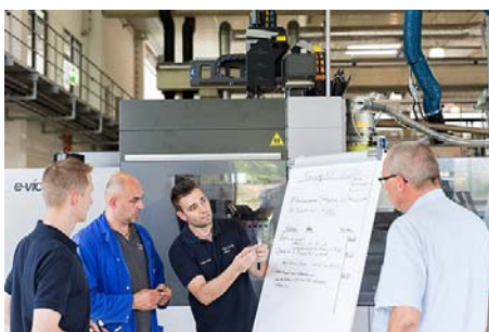
Discussion in the production department