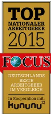
“Germany’s Best Employer 2015” seal

http://www.ensinger-online.com/download/download.php?id=81347e983d795e32f4a8dad002e8de9d