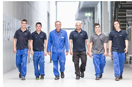
Tutors and trainees