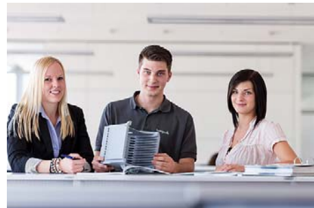
Next-generation specialists at Ensinger