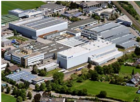
Ensinger's Nufringen location is the headquarters of the company group