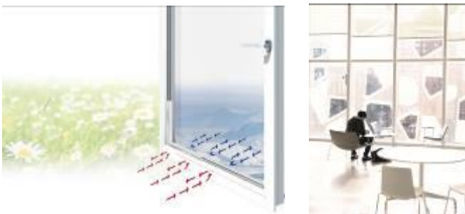
Photo 5 + 6: Warm Edge spacers like Thermix permit particularly energy-efficient insulating glazing, e.g. in the new Student Learning Center at Ryerson University in Toronto, Canada.

High-quality pictures: Download ZIP or via press.info@oha-communication.com