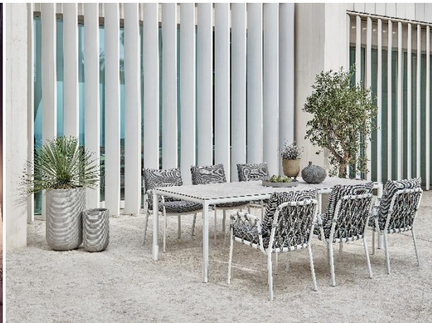
Fig. 8, 9: With its slim design, Urban is ideal for the balcony. Soft, on the other hand, can certainly spread out: The table with its rounded inner edges can be extended to 260 cm. The Dekton® top retains a continuous grain even when extended.

All images may be used free of charge for editorial purposes provided the source is acknowledged.