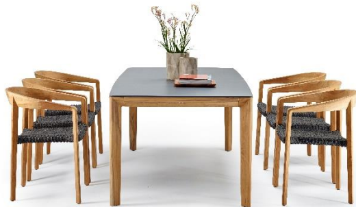
Fig. 6, 7: Charlie and Lodge have a slight bow shape to which the tabletop made of Dekton® can be perfectly adapted with rounded edges.